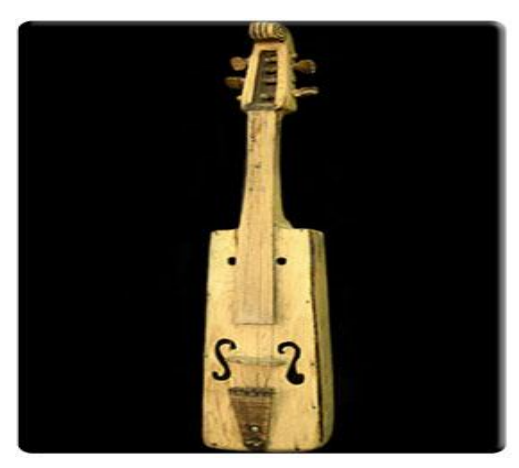
Figure 3. Turkmen Kemençe

"The second kind of kemençe (Figure 3) is the Turkmen Kemençe, which is an instrument of the South Anatolian Turkmen. Ali Rıza Yalgın illustrated and published the regional kemençe in his work titled Karatepeli Region in Toroslar both while being played and as an instrument. Although it has similarities to the Black Sea kemençe, it is larger and bulkier." http://www.gorele.gov.tr/kemence (12.10.2020).