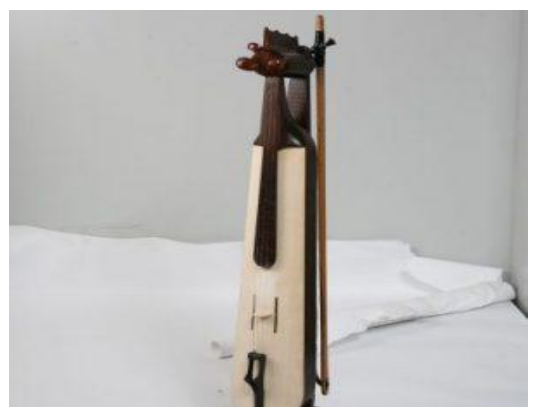
Figure 4. Black Sea Kemençe (Görele Structure)