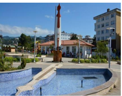
Figure 1. Kemençe Statue and House in Görele District

Görele's main folk dance musics are Tuzcuoğlu, Hasbal, Hamzabaş and Bey Horon. K. Şadi ( personal interview, 10.05.2012).