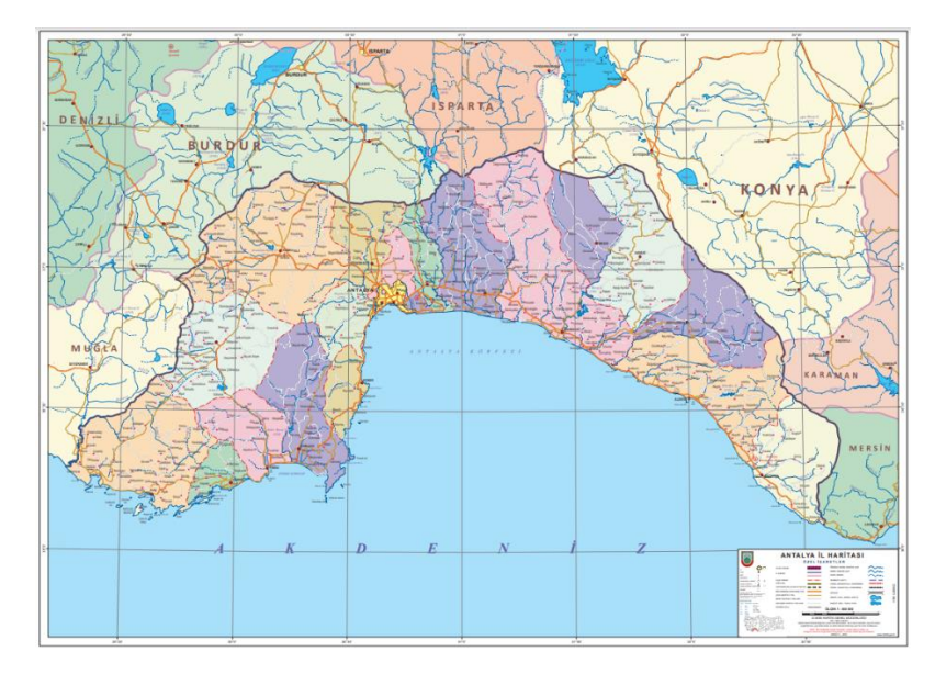
Figure 1: Study Area

General Directorate of Forestry (2021) reported that 485,305 hectares of land were destroyed as a result of 72,360 forest fires between 1988-2021. In addition, the year 2021, in which 2,793 forest fires occurred in Türkiye, was reported as the year in which the most forestland burned in a year (28.7%, 139,503 hectares) in the history of the country (General Directorate of Forestry, 2022). In this context, the study area of the research has been determined as the Mediterranean region, which is covered with first-degree fire-sensitive forest areas in the south of Türkiye (Güngöroğlu, 2018) and is seriously affected by the forest fires of 2021 (Fig. 1). The area of the region is 2,300,000 km². Its topographic structure is divided by narrow and deep valleys due to its complex geology (Arslantürk and Ketenoğlu, 2008). The 2021 Türkiye Population Map data shows that the total population of the Mediterranean region exceeds 10 million (Ministry of Interior, 2021).