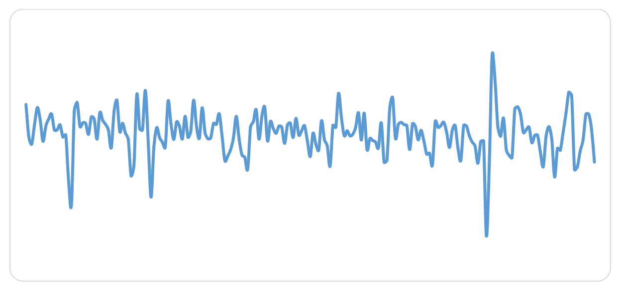
Figure 1: FX Market Pressure Index for the Period of February 2005-October 2021

Figure 1 shows the FEMPI in the Turkish economy between February 2005 and October 2021. The regions where the index is negative suggest that the pressure is increasing, while the regions where the index is positive show that the pressure is decreasing. It can be seen that the FEMPI increased in February 2006-August 2008, and August 2018. On the other side, it can be observed that the pressure has dropped since August 2018. It is understood that the foreign exchange market pressure index is in a certain band range, which means that the international reserves and the nominal exchange rate are kept under pressure and are not exposed to economic shocks.