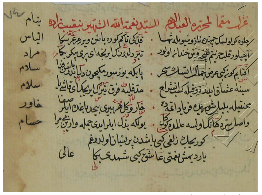
Excerpted from Mecmu 'â-i Mu 'ammeyât , Süleymaniye Manuscripts Library 28 HK 3647 (no. 179)