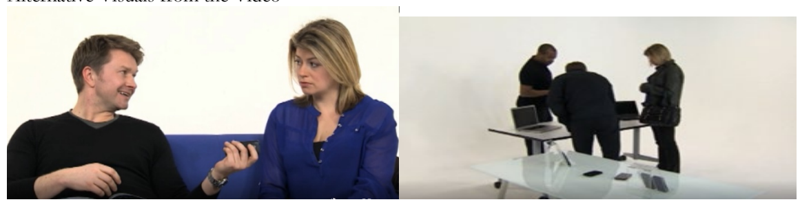
Work with a partner and discuss the questions below.