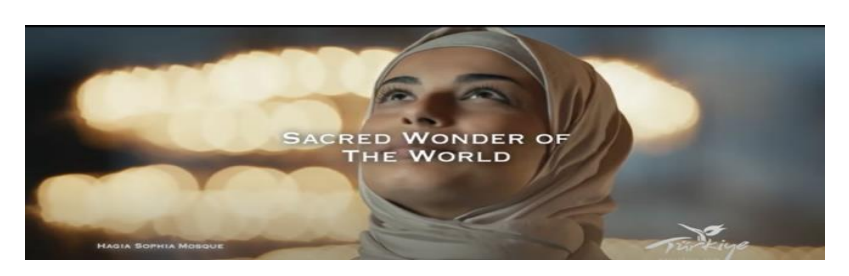
Picture 2. Hagia Sophia Promotional Video with a Message and Character Elements